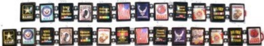
Defender's Bracelet $5