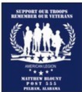
Post 555 T-Shirt S-XL - $20 XXI-XXXL - $22

(Proceeds Benefits Post 555 and Department Programs)