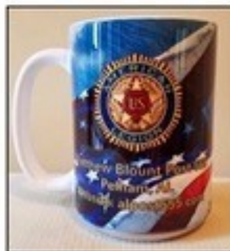
Post 555 Coffee Mug $ 10