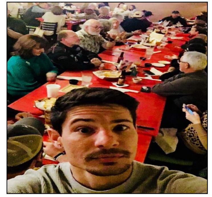
Triple Nickel Riders' Christmas Party

To close out the month we rode in as a group to the WAA, it was a early morning of waffles and coffee, some jokes and war stories. The group of five rode to Veterans Park Alabaster to meet up with the Patriot Guard Riders, as group we rode in the Alabama National Cemetery. The last step to complete the day for the Riders is to complete a Flag line. The Flag Line is very important to protect the families during the time of paying respect to their fallen Hero. To read more about the Flag Line and the Patriot Guard Rides go to www.patriotguard.org