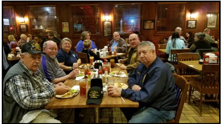
The American Legion invades Bob Gibson Bar-BQ for food & fellowship