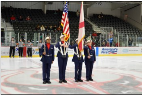
Thompson High School JROTC Color Guard