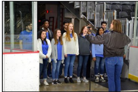
Pelham High School Choir