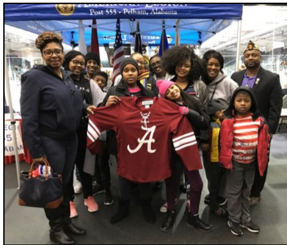
Ward Chapel AME Church YPD Youth Group