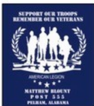
Post 555 T-Shirt S-XL - $20 XXI-XXXL - $22

(Proceeds Benefits Post 555 and Department Programs)