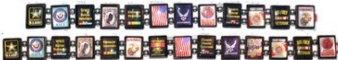
Defender's Bracelet $5