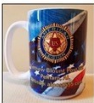
Post 555 Coffee Mug $ 10