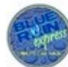
Car Fund-raiser Benefiting Oratorical Scholarships $7 value for $5