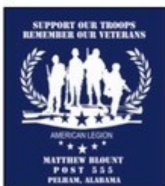
Post 555 T-Shirt S-XL - $20 XXI-XXXL - $22

(Proceeds Benefits Post 555 and Department Programs)