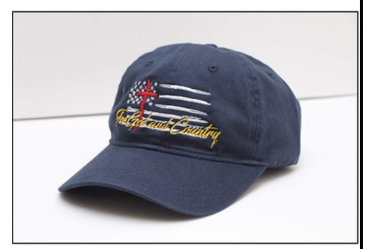
New offering from the Post Store