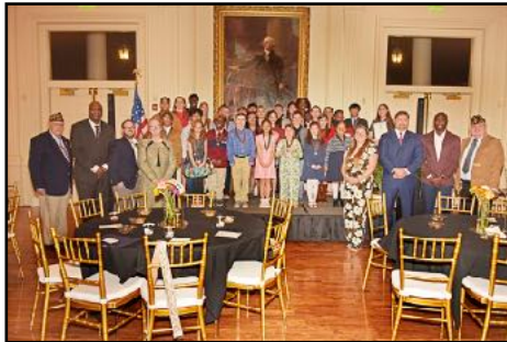
Post 555 held its Student Character Award Banquet to recognize Shelby County students with high academic achievements and displayed high character during the year.