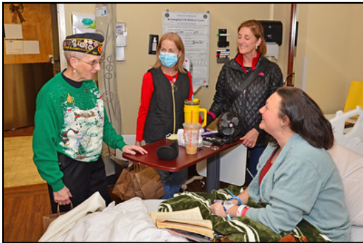
Members of the Post 555 family distributed 100 Christmas gift bags to patient of the VA Medical Center as part of the annual VA Christmas Caravan.