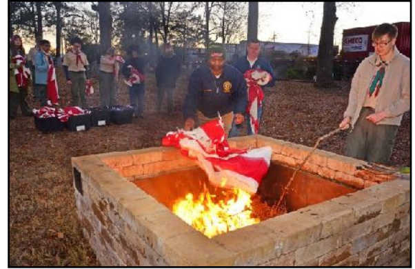
Boys Scouts of America Troop 404 (Pelham Troop 404) conducted a Flag Retirement Ceremony at the City of Pelham Cemetery. Local Scouts and leaders, neighboring Scouts, parents, and members of The American Legion Matthew Blount Post 555 gathered around a fire pit to observe how to properly retire a worn-out (faded, torn, or otherwise unserviceable) American flag. Matthew Blount Post 555 is the Charter Sponsor of Troop 404.