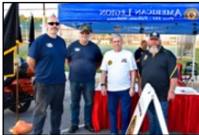
Sons Squadron 555