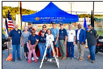
Pot 555 Family