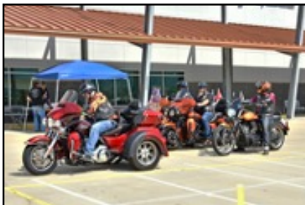
Triple Nickel Riders