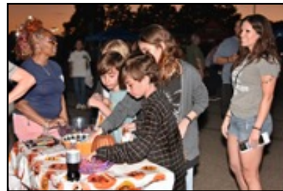
Auxiliary Trunk a Treat