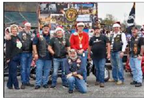
Triple Nickel Riders

View Parade Photos at https://alpcsl555.smugmug.com/12-10-2022-Pelham-Christmas-Parade/