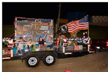
City of Pelham Christmas Parade