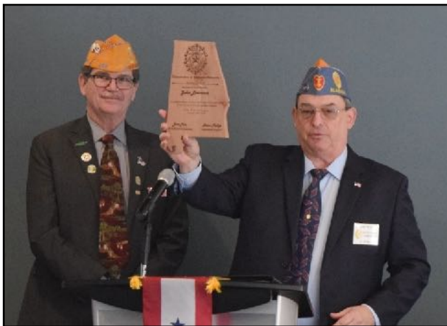
National Southeast Viv Command with Detachment Commander