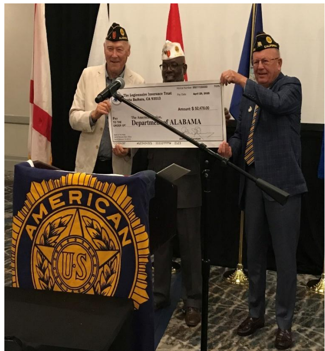
Legionnaire Insurance Trust check being presented to the Department of Alabama in the amount of $52,478.00!!!