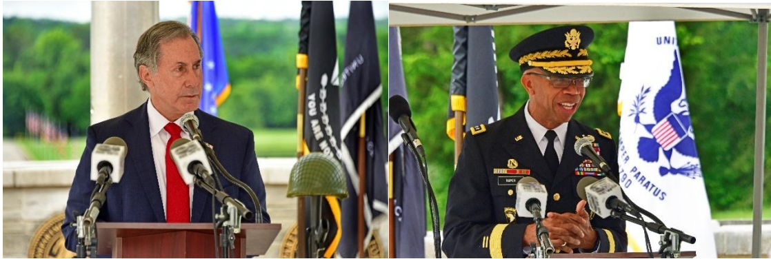
L/R: Congressman Gary Palmer, VIP