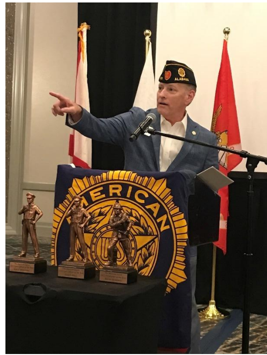
Department of Veterans Affairs Commissioner Jeffrey Newton.