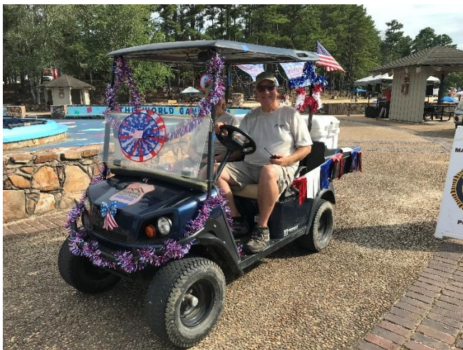
Oak Mountain State Park Rep offering water!