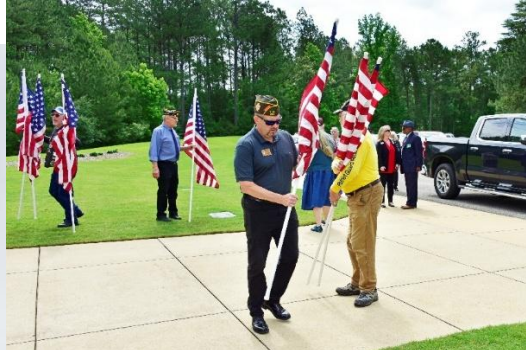
The Patriot Guard Riders always furnish flags to honor Veterans’ services. A great sight and tribute.