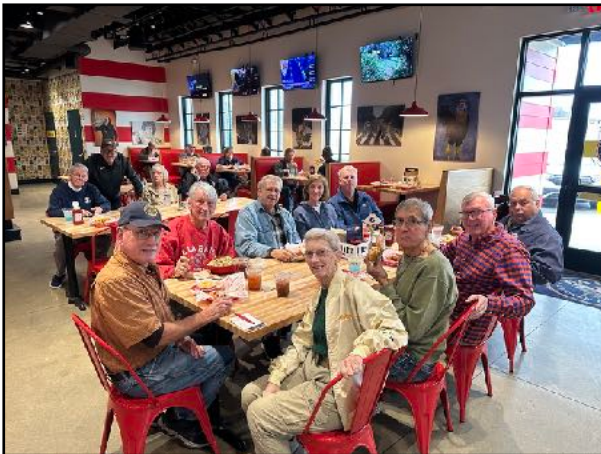
Post 555 continues to hold monthly lunch with the Relative Old Veterans Eating Out group. All veterans are welcome, young and old.