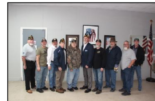
Hosted by Post 17-Talladega