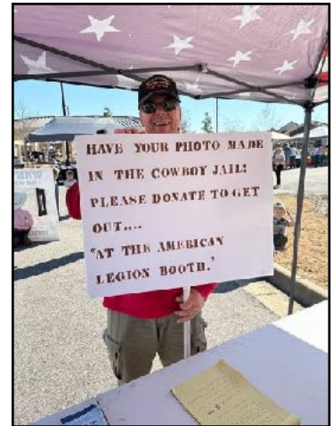
Post 131 participates in Columbiana's Cowboy Day