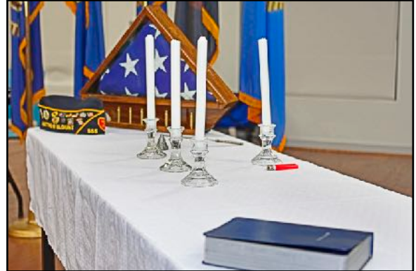
Post 555 holds Post Everlasting for three fallen comrades.