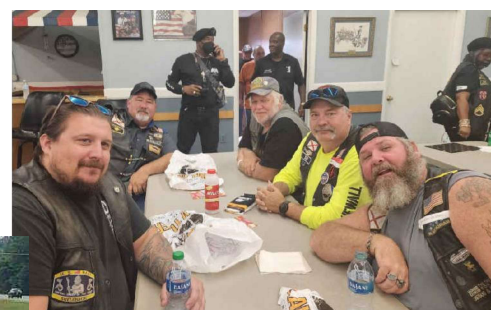
Riders lunch... of course