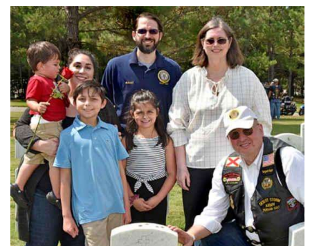
The Blount family