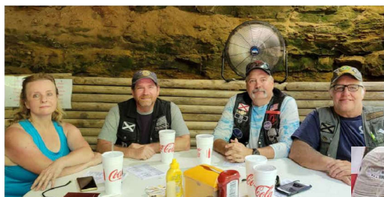
At the Rattlesnake Saloon