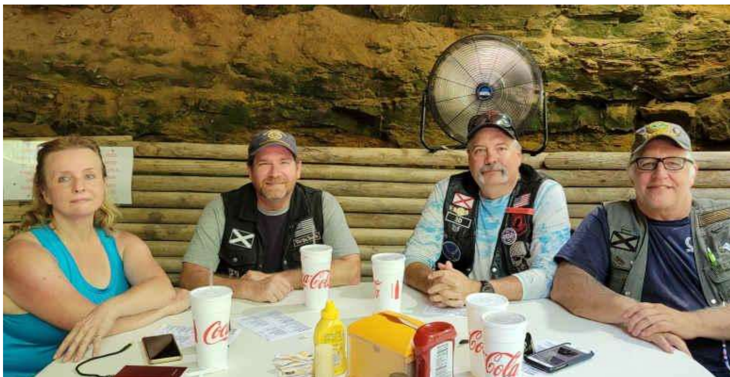
At the Rattlesnake Saloon