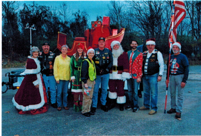
Photo with SANTA!!! How could we not have one of these in the recap of the Christmas Parade???