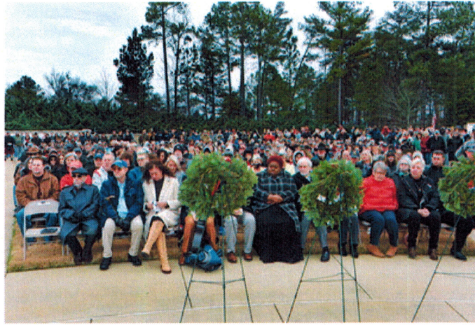
Large crowd showed up to support the WAA mission which is “Remember, Honor, and Teach”. Beautiful crowd included many young people and youth organizations.