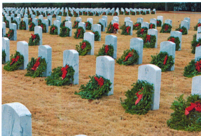
Many of us have loved ones and friends at the ALNC, so words cannot express how we feel seeing this sight. Thank you to our team and all the Volunteers who made this happen. Never Forget!!!