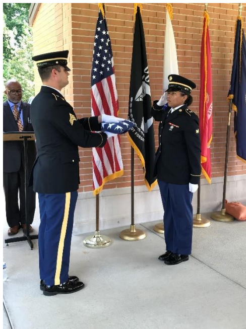
Flag-Folding ceremony completed; will be presented to a family member of a Fallen Hero.