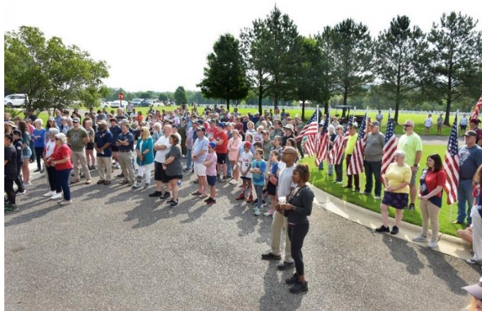
Huge amount of family members and Volunteers for the Flag Placement.

project did not take much time due to a huge amount of Volunteers from several different organizations. Great effort from all!!!