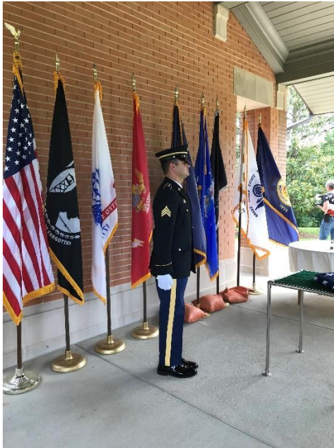
Member of the ALARNG Military Funeral Honors Team getting ready for the TAPS Ceremony.