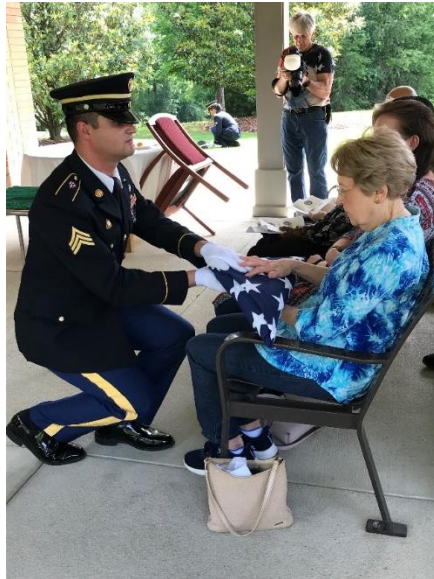
ALARNG Funeral Honors Team member presenting a flag to a family member.