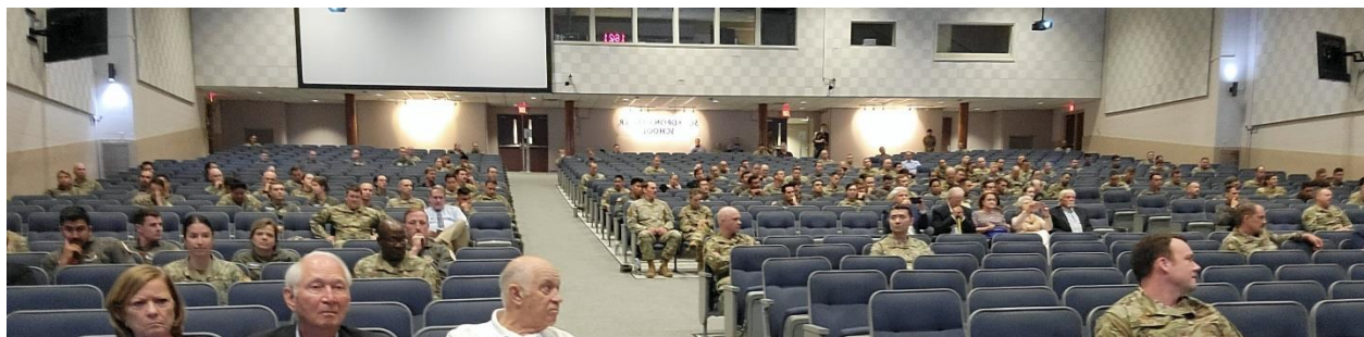
View of Polifka Auditorium from the stage. The audience was largely combat-tested active-duty officers with Special Operations and Rescue experience.