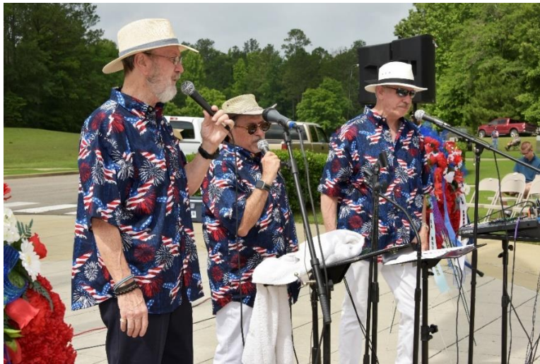
Homeland entertaining us as only they can.