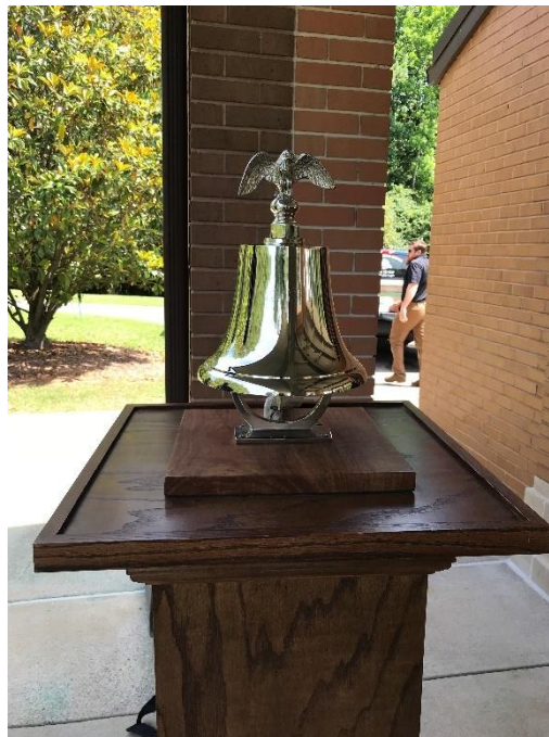
The ceremonial bell that is rung for all of the Fallen Heroes in each branch of military service.