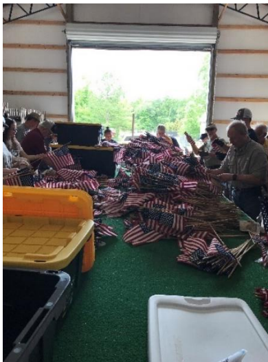
Flags everywhere, but there were plenty of Volunteers!!!