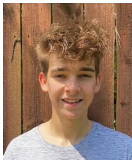
Picture of the 2021 Boys State Delegation