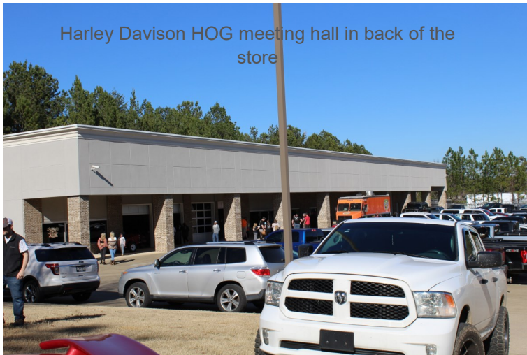
Harley Davison HOG meeting hall in back of the store

Post 555 Membership will meet on Thursday October 14th at the Harley Davidson's HOG meeting hall at 7PM. Dinner and fellowship at 6PM