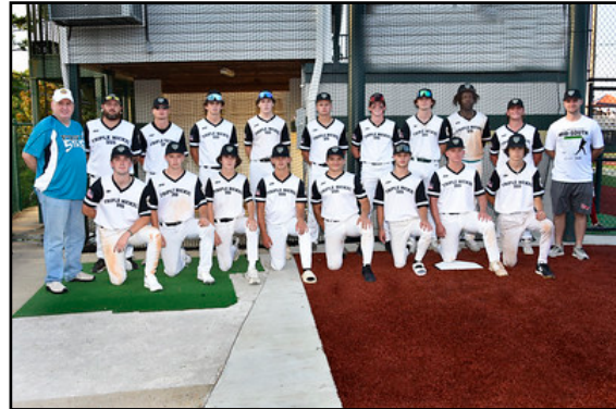
The Triple Nickel Baseball team place in second placed in the 2023 Alabama State Tournament.