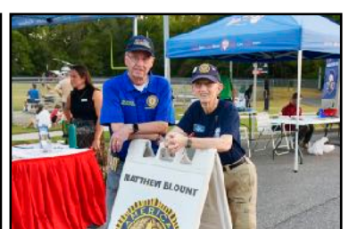
Post 555 participates in 2023 Pelham Night Out